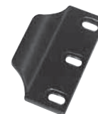
1609 3 1/4" x 1 1/16" x 3/8" (H x W x D) Requires coordinator. Panic device only.