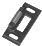
264 2 7/8" x 1 1/4" x 9/16" (H x W x D) Panic device only.