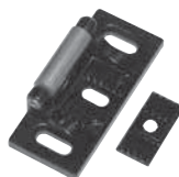
299 7 7/8" x 1 1/4" x 13/16" (H x W x D) Panic device only.