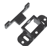
499F 3 5/8" x 1 1/2" x 16/16" (H x W x D)