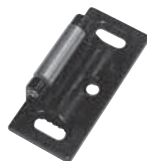
299F 2 7/8" x 1 1/4" x 13/16" (H x W x D)