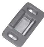
1606 2 7/8" x 1 3/8" x 3/8" (H x W x D) Panic device only.