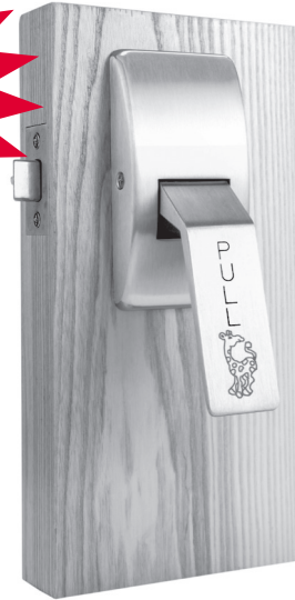
Optional Round Cover & Custom Engraving Shown

Optional "Q" Quiet Latch available - Zero decibels gained when operating the handles. Patent(s) pending.