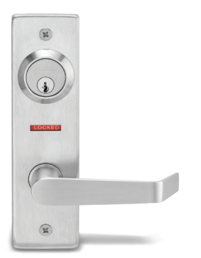
1. Abrasive, knurling and lead wrap options not available on Latitude, Longitude, Broadway and Boardwalk levers.

Two different variations are available to communicate the status of the door on the outside: Occupied/Vacant or Locked/Unlocked. Available in sectional or escutcheon (shown) styles. Please consult the price book for additional details.